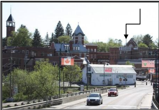
Six Degrees from Taylor Road

visible as you enter town via Taylor Road.